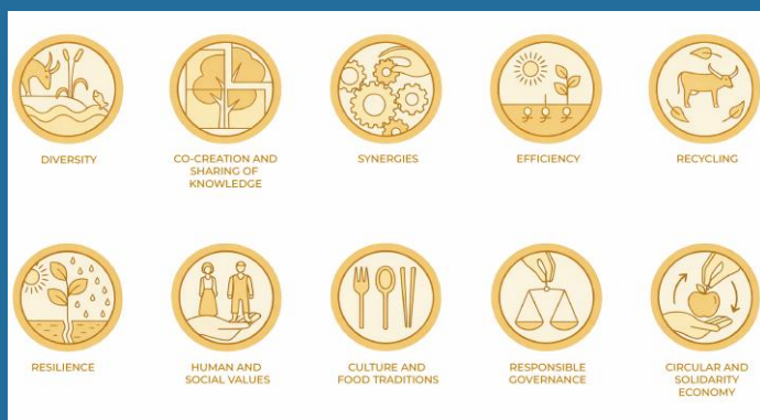
FAO's 10 Principles of Agroecology (2018)

Through a number of principles, agroecology promotes sustainable agricultural practices as well as the "better life" of farmers. At the same time a scientific discipline, agricultural practices and a social and political movement, agroecology aims to transform the food system as a whole. Agroecology is about "taking care" of the environment and people: preserving ecosystems, and strengthening the rights and quality of life of rural populations. The fight against gender inequalities and other social inequalities is therefore an integral part of agroecology (Iles de Paix, 2021; Oxfam, 2024).